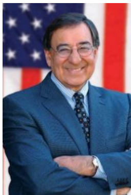
Hon. Leon E. Panetta Chairman The Panetta Institute for Public Policy FSU Alumni